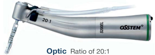
Optic Ratio of 20:1

Stable deceleration ratio of 20:1 makes almost every surgery case completed reliably.